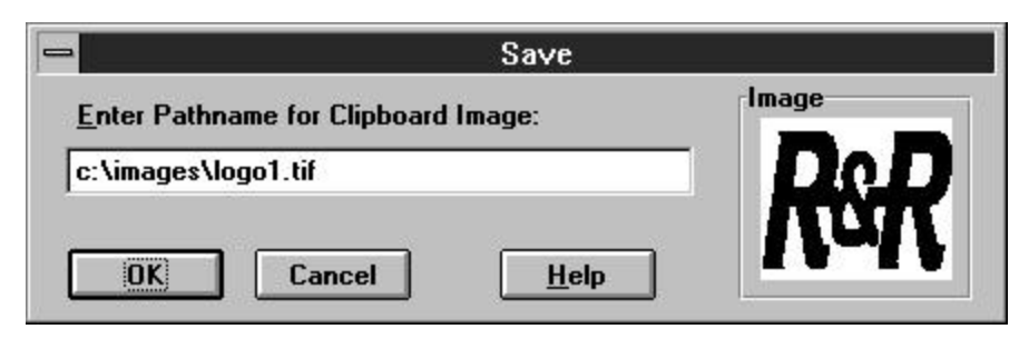
Figure 14.3 Save Report with Clipboard Image Dialog

When you retrieve a report with a saved Clipboard image, R&R looks for the image file first in the current library directory; if the file is not found, R&R then looks in the directory saved with the report. If the image file is in neither location, R&R looks in the default image directory.